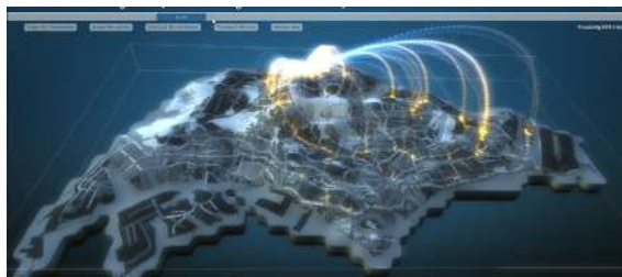
Visualisation of transportation trajectory in peak hours

XSMART has been successfully deployed at the multi-agency test bed, with integration to a shared sensor network of close to 1,000 IoT sensors and video analytics of more than 25 optical sensors. XSMART is also a highly secure and capable the data platform, it serves as a centralized platform for data aggregation and analytics exchange, with capabilities to integrate, manage and analyze information that provide a coherent big-picture view of the data and derived insights. This is a value-added solution that includes cutting-edge Big Data Analytics technology that has been developed and proven.